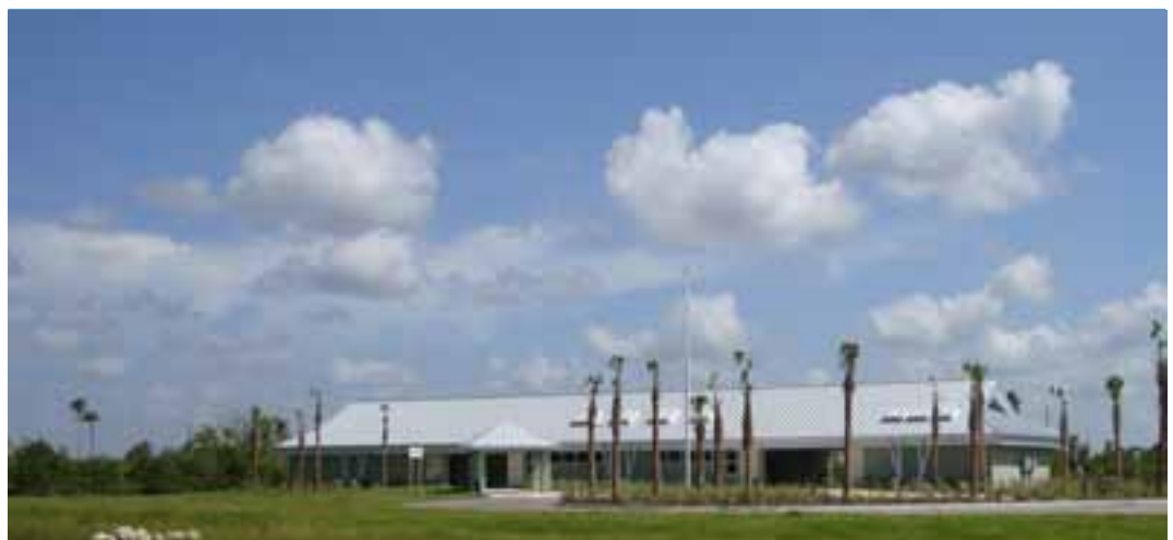
The new Big Cypress Swamp Welcome Center on U.S. 41 in Southwest Florida

The center will be open daily from 11 a.m. to 1 p.m., with daily screenings of a new Big Cypress documentary by Elam Stoltzfus and an exhibition of Big Cypress photographs by acclaimed photographer Clyde Butcher.