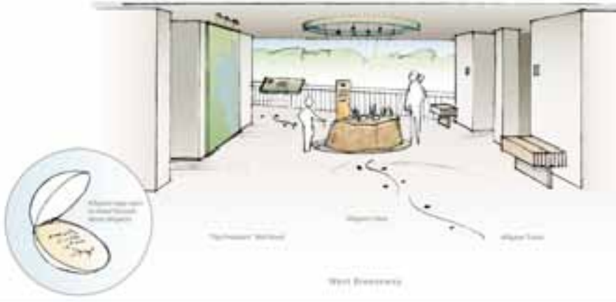
Above: Alligators & other top predators, West Breezeway.

Individual, corporate and foundation donors can support the project by underwriting specific exhibits or by making a contribution to support the general campaign. For a complete list of exhibits, contact the Trust.